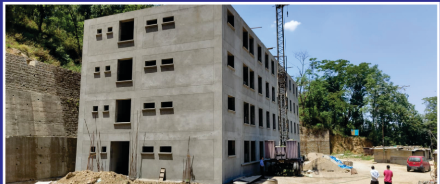
New Campus Under Construction